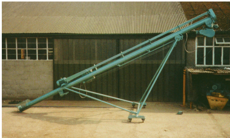
8" Auger with swivelling thrower head . 60-80 TPH.

Auger design and manufacturing for Agriculture and Industry