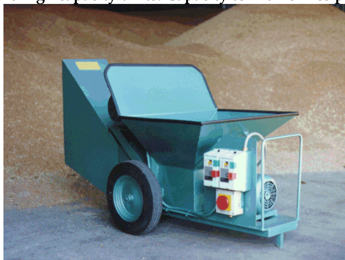
60 tph model illustrated

Portable high capacity units. Capacity to 120 Tonnes per hour